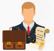
Speak with an attorney