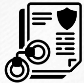
Ask for a Warrant

Note: If immigration officials take items from your home, keep a record of what they took and ask for a receipt for the items.